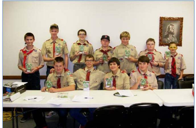
Members of Grove's Boy Scout Troop 78 show off their Electronics Merit Badge completed projects. The instruction sessions were sponsored by Northeast Rural Services.

Troop 78 from Grove recently earned the Electronics merit badge at a recent series of classes. The Scouts each completed coursework and assembly of a printed circuit board soldering project.