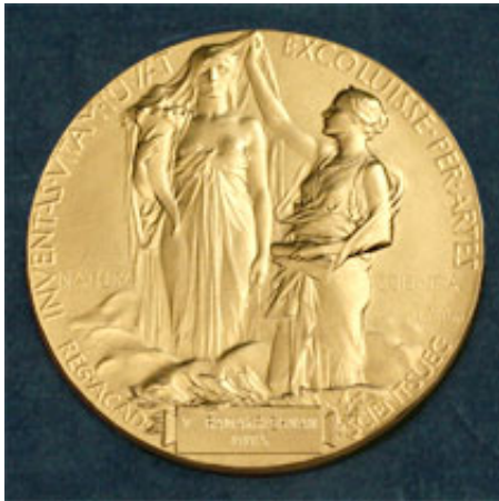
Nobel Prize for chemistry

Moerner shares the $1.1-million Nobel Prize in chemistry with Eric Betzig of Howard Hughes Medical Institute and Stefan W. Hell of the Max Planck Institute for Biophysical Chemistry in Germany. His research is praised for making it possible for researchers “to view the toxic protein accumulations in brain cells of patients with deadly Alzheimer’s and Huntington’s diseases.” Because of his work, researchers “can also study how biomolecules—such as DNA and enzymes—work in cells to carry out the processes that are critical to life.”