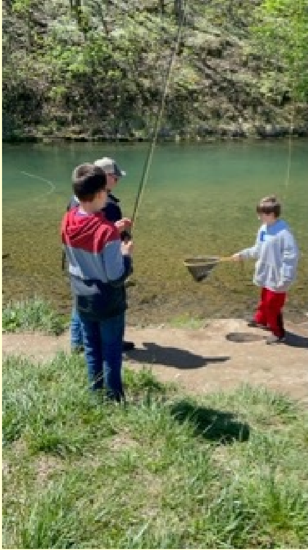
Troop 2000 went fly fishing at Roaring River.